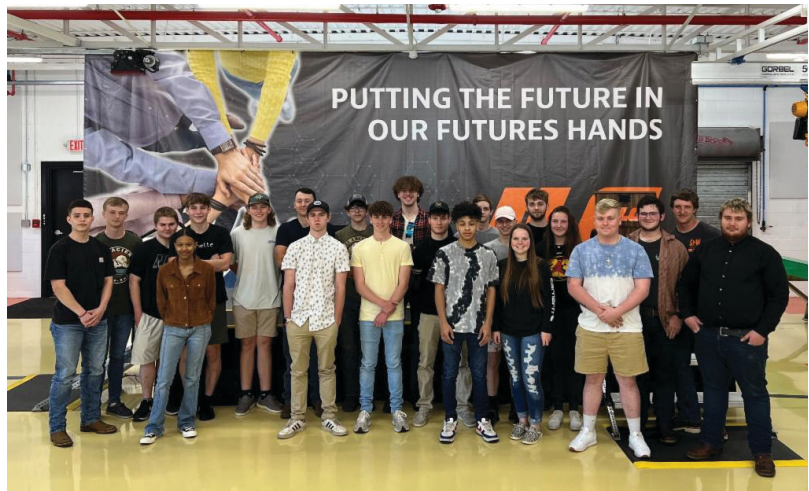
Nine Bedford County Technical Center seniors graduated from the School to Work Program and were all offered full-time employment with JLG Industries.