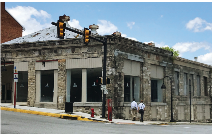
The Old Ford Garage in Downtown Bedford

Department of Community and Economic Development (DCED) recently announced the approval of $17,475 through the Industrial Sites Reuse Program (ISRP) to BCDA to conduct an environmental assessment of the former King Motor Company building, also known as the Old Ford Garage.