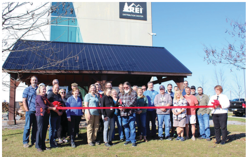
REI hosts a ribbon cutting ceremony to celebrate 15 years of being in Bedford County