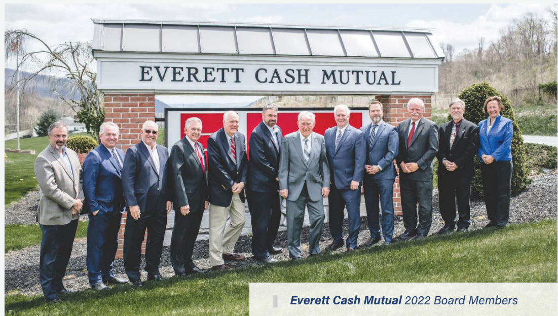
Everett Cash Mutual 2022 Board Members